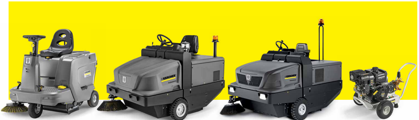
KM 85/50 R Bp Sweeper

If you're looking for maximum performance for the toughest jobs, the KM 150/500 R Bp is your machine. It includes a robust steel chassis, durable and reliable components, and a dust filter system. The HD 3.0/27 G cold water pressure washer can easily blast debris from sidewalks, parking lots, and building exteriors to keep your building looking presentable.