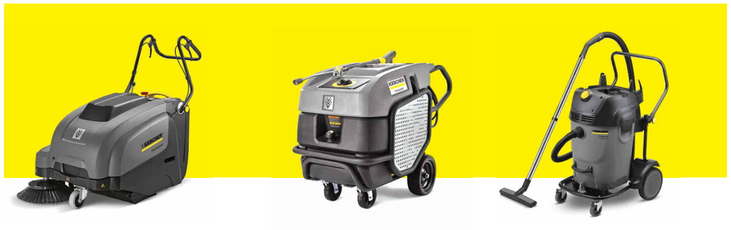
KM 75/40 W Bp Sweeper

Kärcher's NT 65/2 TACT wet/dry vacuum easily picks up water and dust from tough to reach spots. Clean debris, vehicles, machines, floors - whatever the demand, we have a solution.