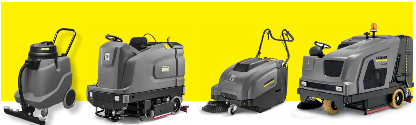
NT 68/1 Wet/Dry Vacuum

Use the KM 75/40 W Bp sweeper to clean congested areas on your manufacturing floor. Its active dust control system keeps dust down and provides better air quality. The innovative B 300 R scrubber & sweeper includes a 79.25 gallon waste water tank, cleaning up to 178,144 square feet per hour.