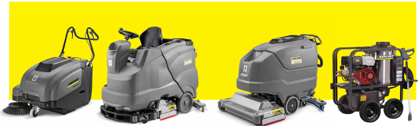
KM 75/40 W Bp Sweeper

Kärcher's B 80 W Bp scrubber features interchangeable cleaning decks, 21 gallon tank capacity, and Kärcher Fleet comes pre-installed. Blast dirt and debris from all surfaces with the hot water HDS 3.5/30 P Cage pressure washer.