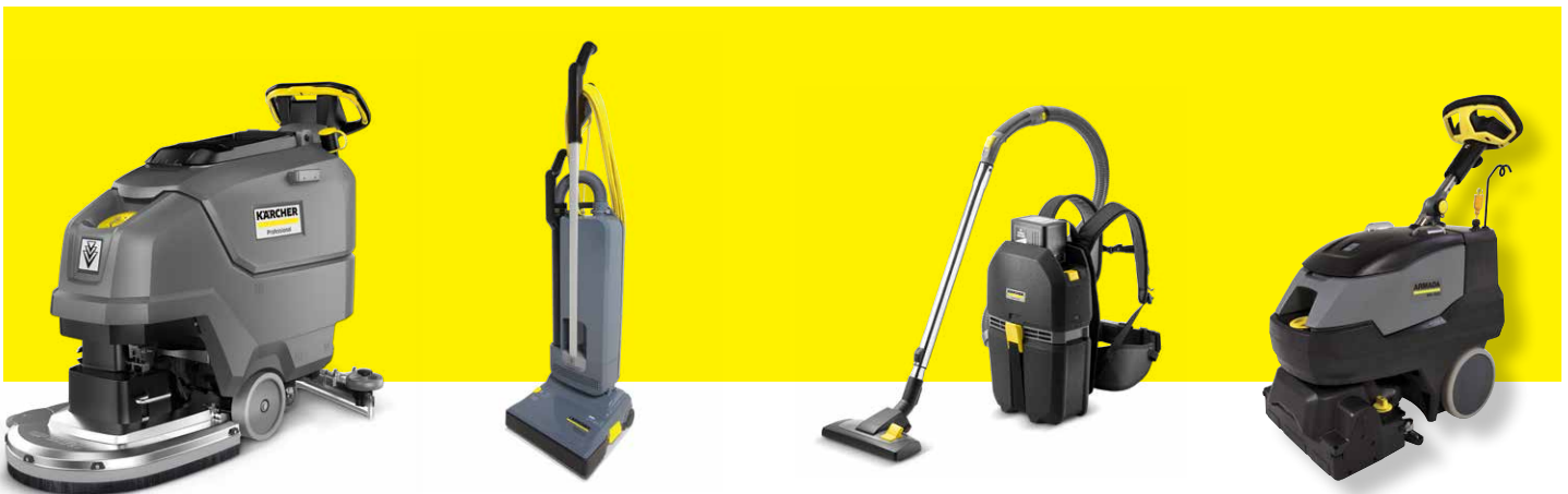
BD 50/55 W BP Classic Scrubber

Kärcher's BVL 5/1 backpack vacuum increases productivity and efficiency. You can easily clean up debris in entrances and high-traffic areas. To remove set-in stains from carpet, use the Armada® extractor, made for cleaning in any direction.